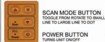
SCAN MODE BUTTON TOGGLE FROM ROTATE TO SMALL LINE TO LARGE LINE TO DOT