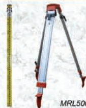
MRL500SP INCLUDES TRIPOD AND STAFF