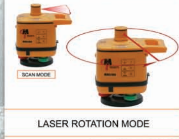
LASER ROTATION MODE