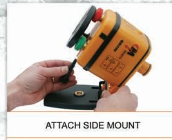
ATTACH SIDE MOUNT