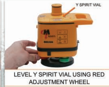
LEVEL Y SPIRIT VIAL USING RED ADJUSTMENT WHEEL