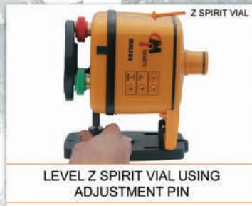
LEVEL Z SPIRIT VIAL USING ADJUSTMENT PIN