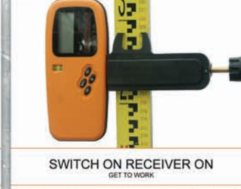
SWITCH ON RECEIVER ON GET TO WORK