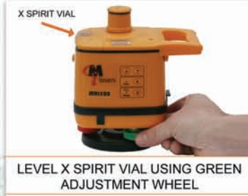
LEVEL X SPIRIT VIAL USING GREEN ADJUSTMENT WHEEL