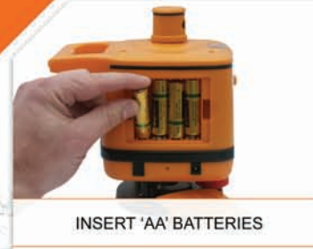
INSERT 'AA' BATTERIES