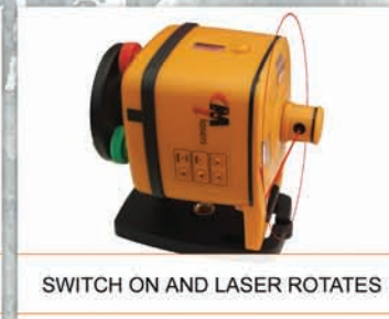
SWITCH ON AND LASER ROTATES