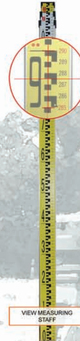
VIEW MEASURING STAFF